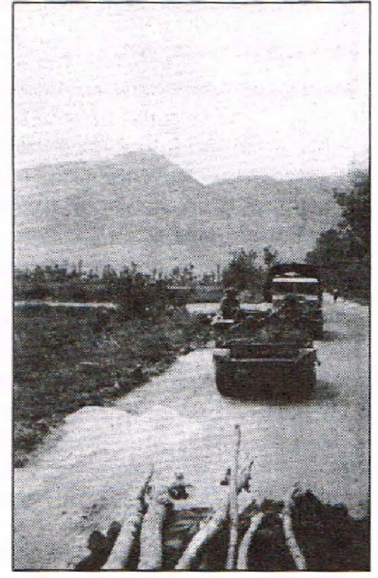
Westministers on way to the Melfa May 1944

Hey boy's just some info on the "new" training system for reserve recruits. What's going to happen soon is recruits will take a 20 training day Basic called BQ "Basic", and then their next course is course called SQ "Support Weapons course" Also 20 training days. On SQ you learn all the support weapons except M-72, that's only done on over seas training now. All trades will take these two courses, after that you go on to your TQ "trades course" And again it is 20 training days. So it takes about 60 training days to get a new troop trained for your unit. It would take about 3 1/2 months for raw recruit to be trained in WATC (weekends off). They found that the 16-day. QL-2 course is just not cutting it for the units. We should see this format for next summer. The SQ course would be great to teach on as well.