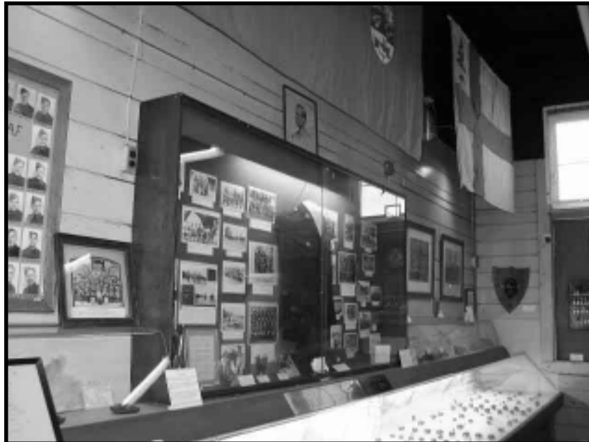
Here is a photograph of the inside of the museum looking at the diorama and another display case.