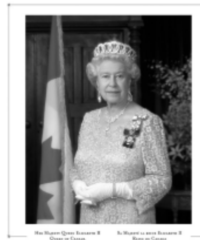
Her Majesty Queen Elizabeth II Queen of Canada

At right is the newly released official photograph of Her Majesty Queen Elizabeth II, Queen of Canada. The originals are in color.