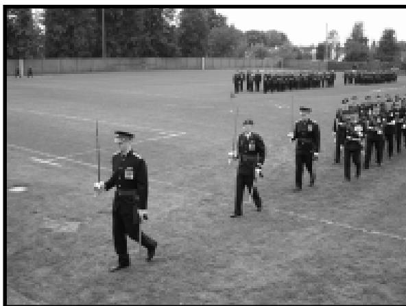
The new CO marches off leading his Regiment.