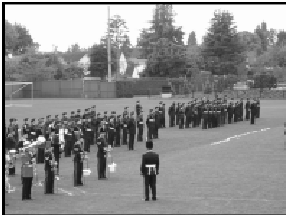
Cadets & Band on Change of Command Parade