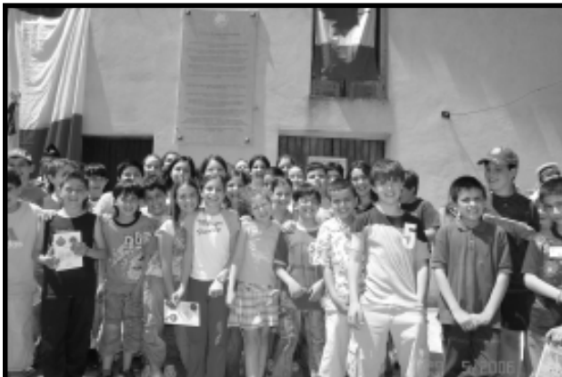
Elementary children pose following their class participation in the Melfa Commemoration