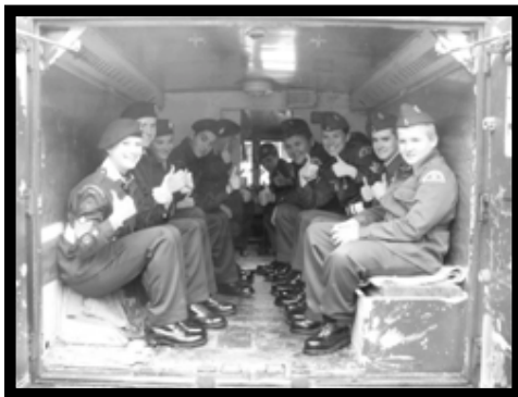
The highlight of the Military Education Centre was certainly the functional military vehicles. Here cadets give a thumbs-up before a ride around the base in a WW2 ambulance.