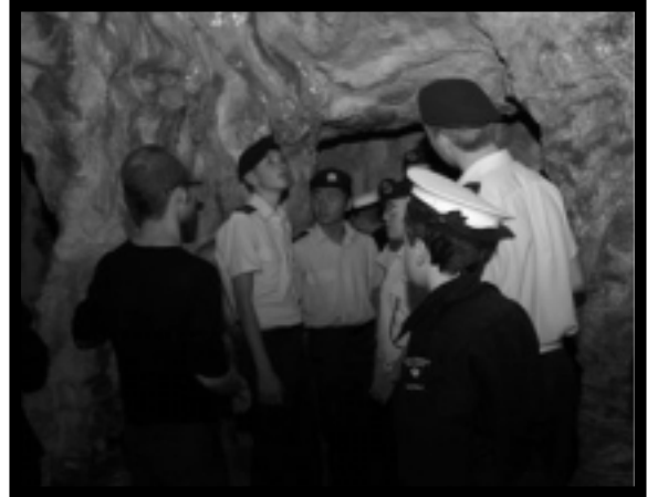
Cadets explore the museum's bat cave.

Then it was time to prepare for the mess dinner. Uniforms were washed and pressed, shirts were starched, and the navy mess rules fervently memorized. Despite all this preparation, several cadets were tried and convicted by the head table presiding over kangaroo court for various infractions, real or imagined. The guards (cadets who forgot their Westie challenge coins) were unable to protect the gavel (or complicit in the plot), and hilarity continued for some time. A paddle with marvellous rope work was presented to 1789 RCACC on the occasion of their visit, which was reciprocated by the presentation of a handsome Royal Westminster Regiment plaque. After the Loyal Toast, the mess was adjourned and cadets socialized and danced the night away...or at least until 2230. Then with declarations of eternal friendship and email addresses yelled from the bus windows, we left 213 RCSCC for our last night at 17 Wing before flying home.