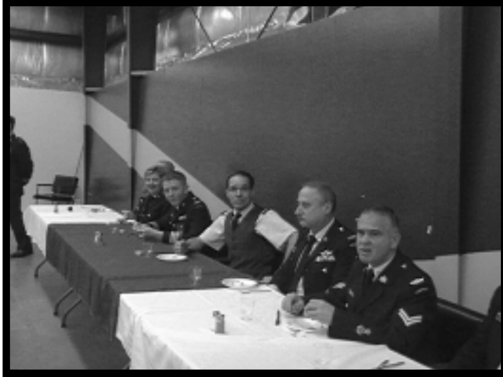
The Head Table