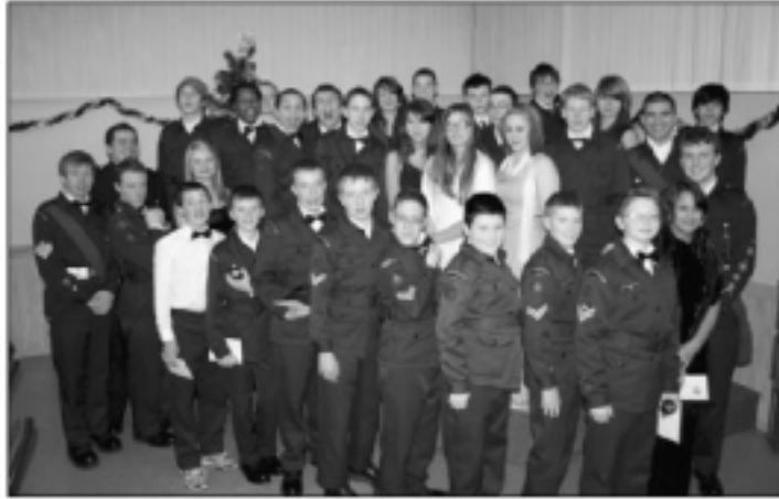
After a wonderful dinner prepared by the Aldergrove Legion, the cadets of 1922 posed together.