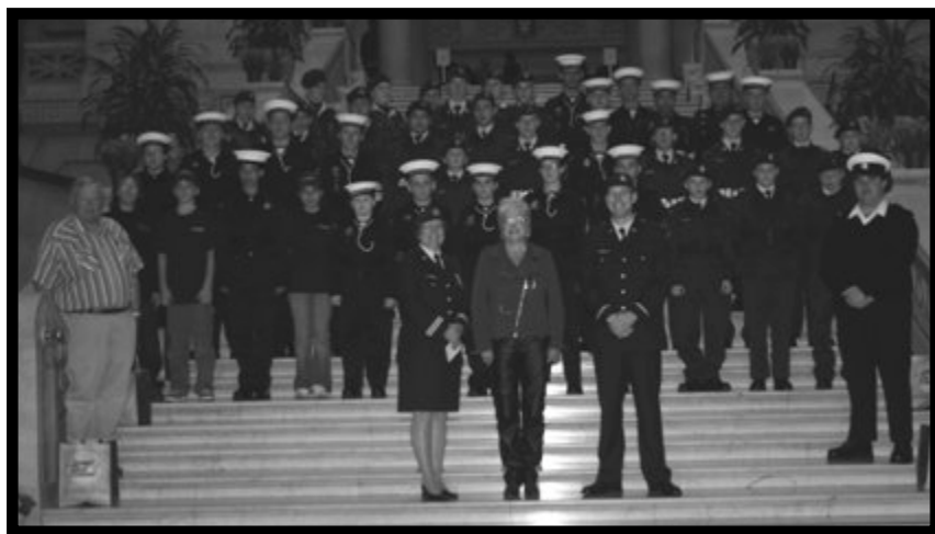
Sea and Army Cadets pose together on the grand staircase in the foyer of the Manitoba Legislature. Front and centre is the Manitoba Attaché for Military Affairs.

On the morning of Friday, 15 October the Army and Sea Cadets met at the Manitoba Legislature for a tour of the building and grounds, graciously hosted by the Manitoba Attaché for Military Affairs.