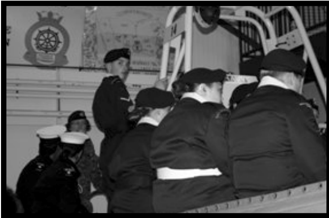
Westie cadets are introduced to one of Chippewa's zodiacs, used during Red River flood rescues.

That evening before the Manitoba Moose hockey game, we paid a visit to 213 RCSCC's home; Winnipeg's "stone frigate" HMCS Chippewa. This was quite interesting as it also houses the Manitoba Maritime museum. There was a quiz to follow the tour, with the prizes including Navy "thunder sticks", perfect for cheering on the Vancouver Canuck's farm team. Unfortunately, the Manitoba Moose lost to the Grand Rapids Griffins, 3-2, despite the massive sea and army cadet cheering section, which made it onto the Jumbotron several times.