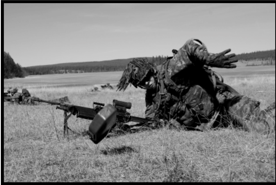
A member of the Royal Westminster Regiment throwing an empty box of ammo he just removed from his C9 LMG