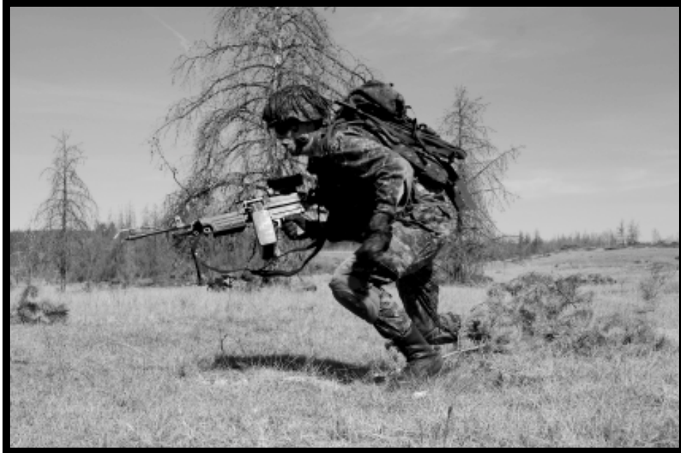
A member of the Royal Westminster Regiment Taking a bound with his C9 LMG machine gun

Ex COUGAR DUCIMUS in Victoria 25-27Mar11