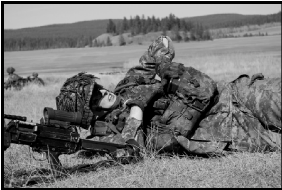
A member of the Royal Westminster Regiment attempting to remove a box of ammo from his C9 ammo pouch on his Tactical Vest