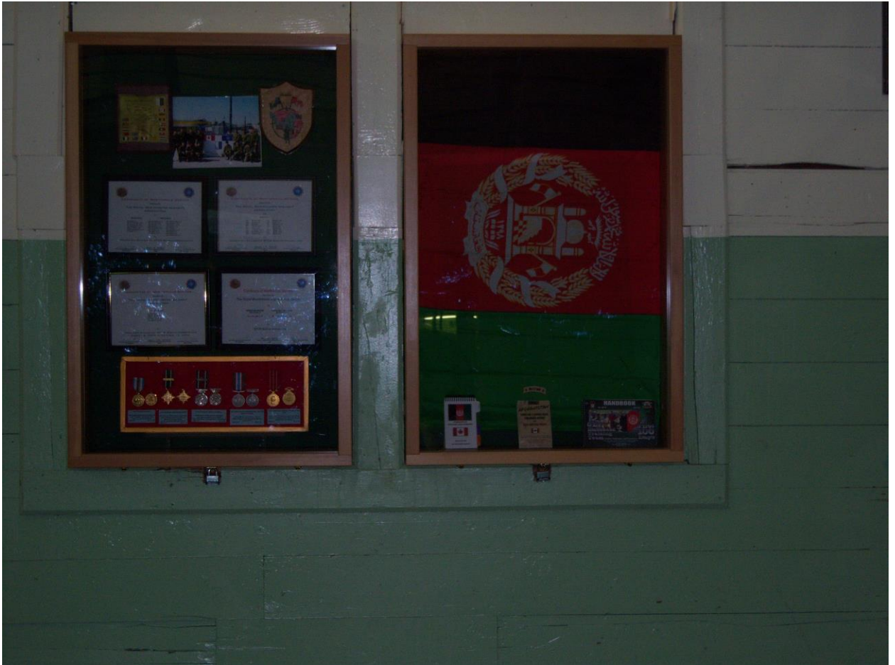
Typical Window Display Cabinet