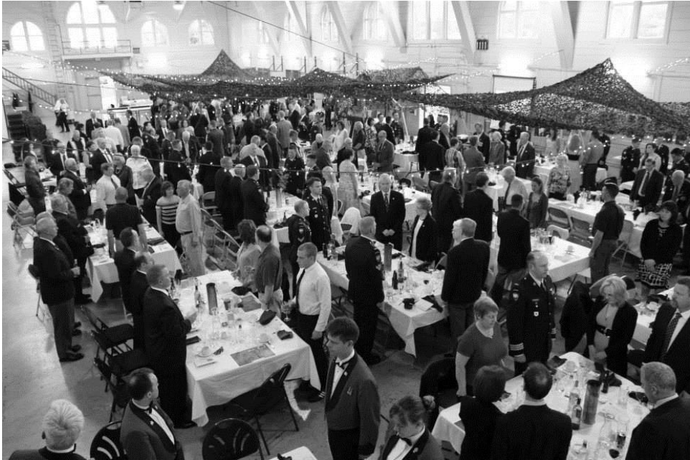
Melfa Dinner 2013