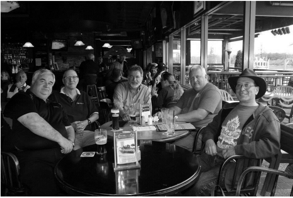
Melfa Weekend After Party Westminster Quay