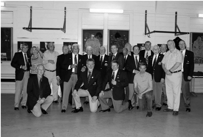
Melfa Dinner 1970's