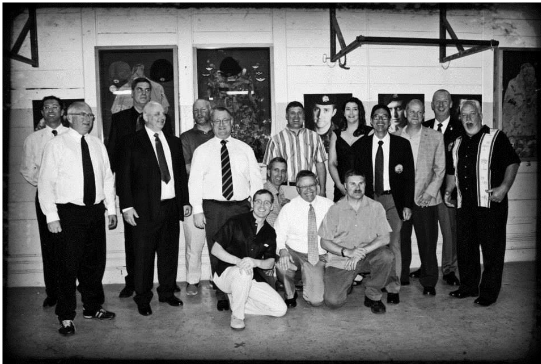
Melfa Dinner 1980's