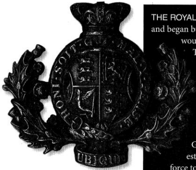
ABOVE Cap badge of the Royal Engineers