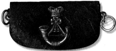
12 | IN THE BEGINNING

THE ROYAL ENGINEERS landed in 1858 and began building the community which would become New Westminster. They also surveyed roads to the Cariboo gold fields and provided police services throughout the Lower Mainland. When they were repatriated to England in 1863, the citizenry of New Westminster petitioned Governor Douglas to establish a volunteer military force to maintain order. The 'New Westminster Volunteer Rifle Company No. 1' was duly authorized on 20 November 1863 and confirmed in writing the next day. The initial contingent consisted of three Royal Engineers who had chosen not to return to England and 70 local citizens.