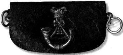
12 | IN THE BEGINNING

THE ROYAL ENGINEERS landed in 1858 and began building the community which would become New Westminster. They also surveyed roads to the Cariboo gold fields and provided police services throughout the Lower Mainland. When they were repatriated to England in 1863, the citizenry of New Westminster petitioned Governor Douglas to establish a volunteer military force to maintain order. The 'New Westminster Volunteer Rifle Company No. 1' was duly authorized on 20 November 1863 and confirmed in writing the next day. The initial contingent consisted of three Royal Engineers who had chosen not to return to England and 70 local citizens.