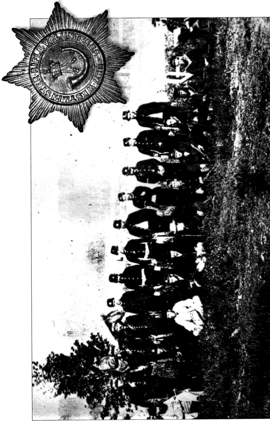
INSET One of the first cap badges worn by New Westminster Volunteer Rifles No.1