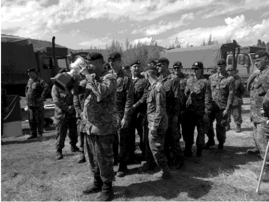
Taste of victory - The winning Westie platoon at the Brigade Mil Skills Competition line up to swill champagne from the Cougar Cup