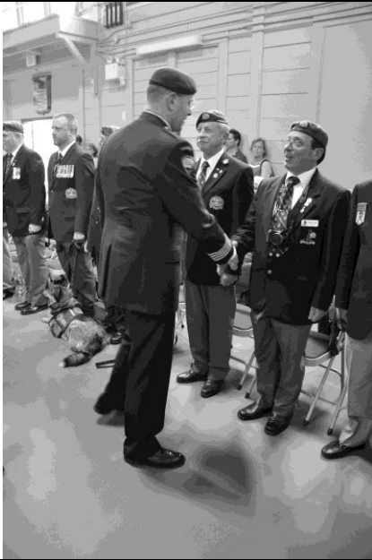
Bde Comd inspects the Old Guard