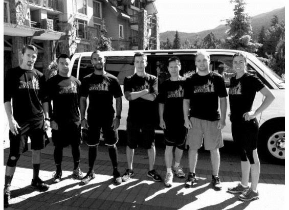
Tough Mudder Team. The Westie team that competed in the gruelling Tough Mudder Competition in Whistler.