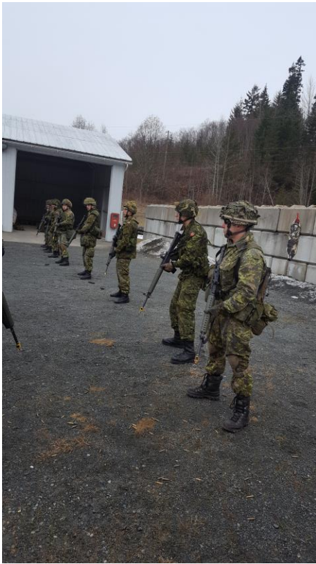
Doing fire team training.