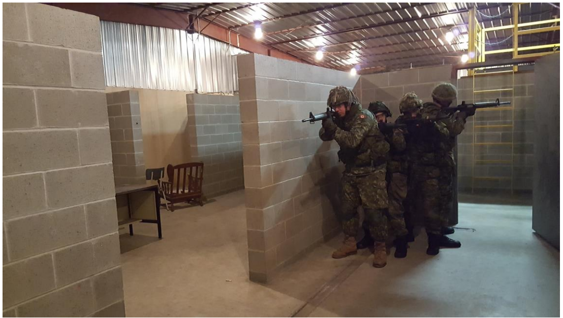
Photo credit, 2Lt Suri Cpl . Pte Bishop-Charvet, Cpl Law, Cpl Urquart. Description: preparing to breach a room on the right.