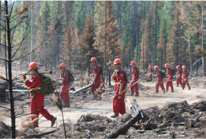
A firefighting platoon sweeps through pine forest in the British Columbia interior searching for hotspots during Op Lentus 2017.

Further, the value of the Reserves were clear on the home front; more than 50 members of the Regiment participated in Op Lentus 2017, supporting or serving on the fire lines in the British Columbia interior during the worst recorded summer wildfire season.