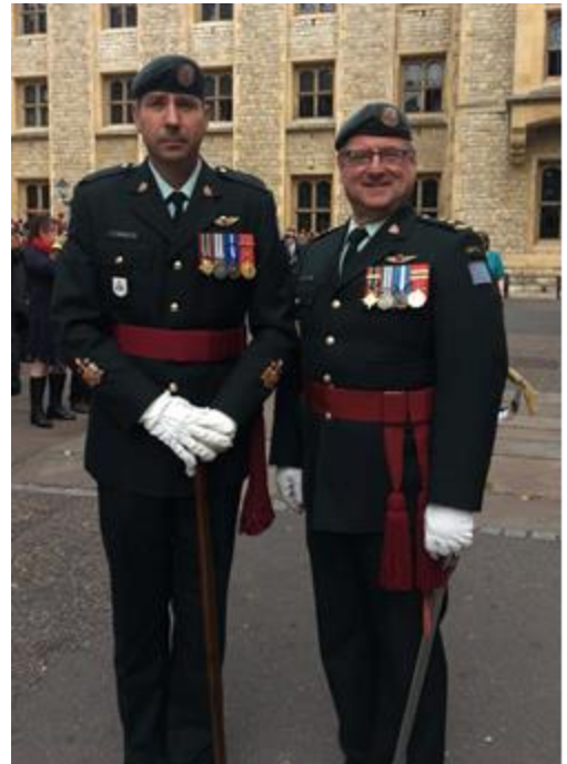
RSM and CO at HM Tower of London prior to commence of FoC parade

We also conducted a small unit exchange with our affiliated Regiment in the UK, the Royal Regiment of Fusiliers (RRF). Thirty-four officers and soldiers, deployed to Tidsworth and Rollstone to conduct Urban Operations Training. This training was located just a stone's throw from Stonehenge. During the first week of September we joined 1, 2, and 5 Battalions RRF along with the Lorne Scots and the Australian Victoria Rifles for a privilege parade exercising the RRF Freedom of the City. HRH Duke of Kent Colonel in Chief of the RRF and the Lord Mayor of London inspected the combined parade. As we were inspected, I recalled that 72 years prior the then Lord Mayor of London had inspected the then Westminster Regiment in London in the immediate post-war wind down.