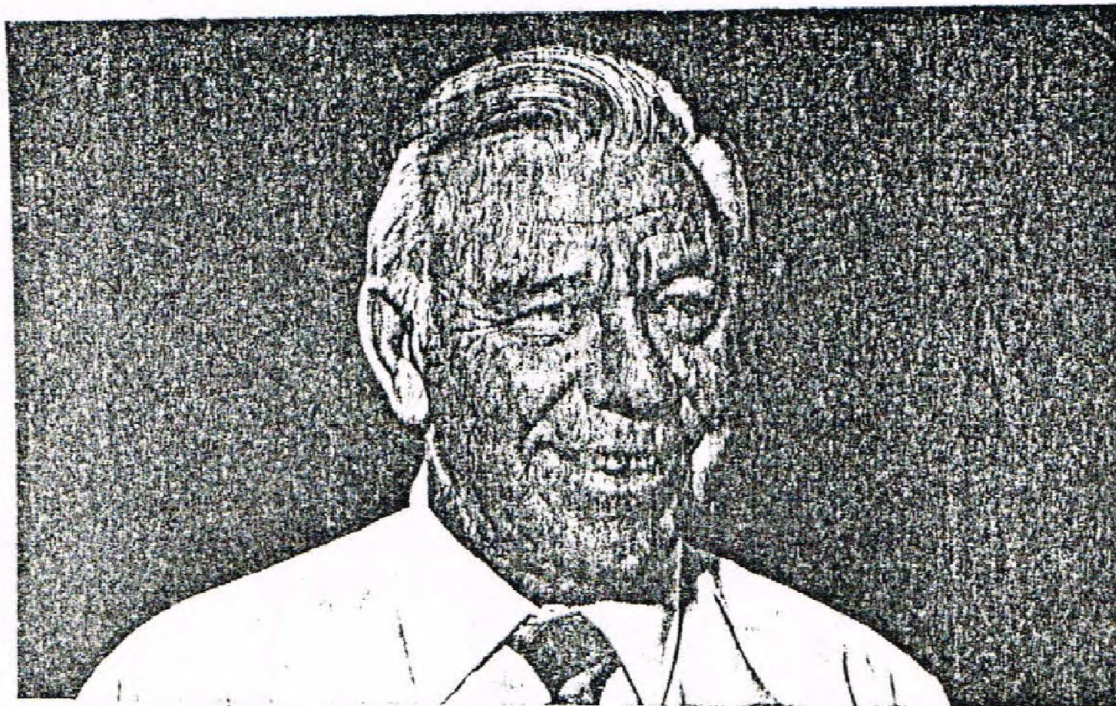
The Royal Westminster Regiment Association John Ford Memorial Bursary