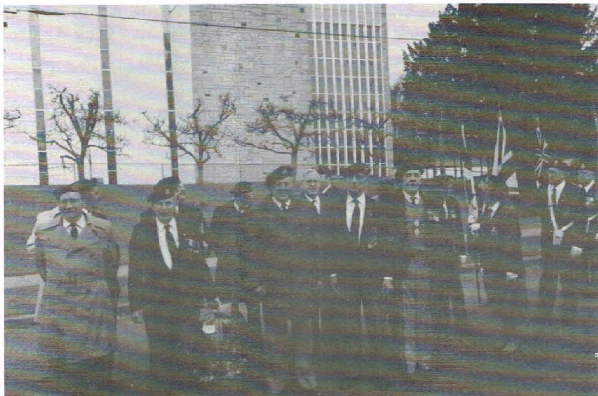
On parade November 11, 1993 Recognize them?

DOUG GLENN / SICK AND VISITING (OF ONE) 522-0890