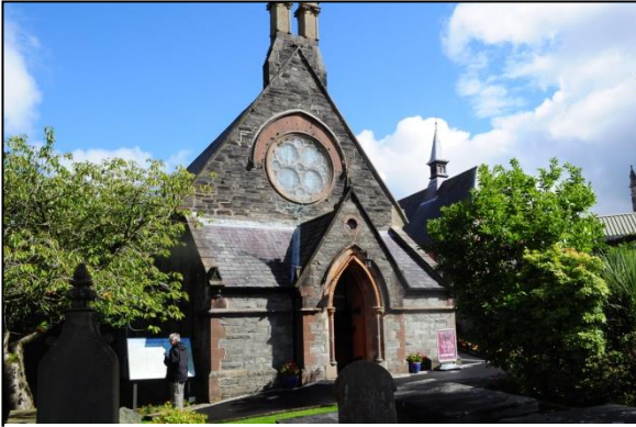
“The Wee Church on the Wall”.

Over the past few years, the Canadian community has been observing various centennial and significant events relating to World War One. Besides our attendance at Remembrance Day services across Canada, Canadians have been travelling to Europe to visit military cemeteries and battlefield sites; the significant one being Vimy Ridge. And while most of our war dead are memorialized in France, Belgium and England, there are many places where our soldiers are remembered by family and communities.