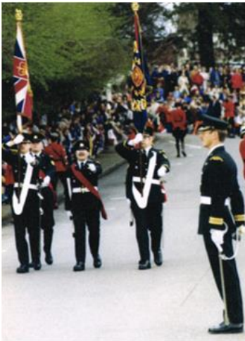
The Colours being marched on