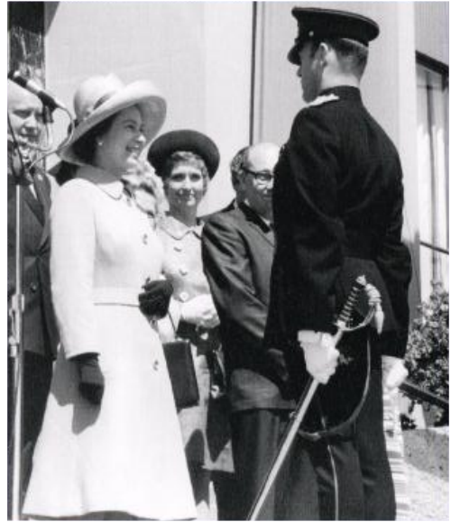
HM Queen Elizabeth being greeted by Lt Col Deane in front of City Hall, New Westminster