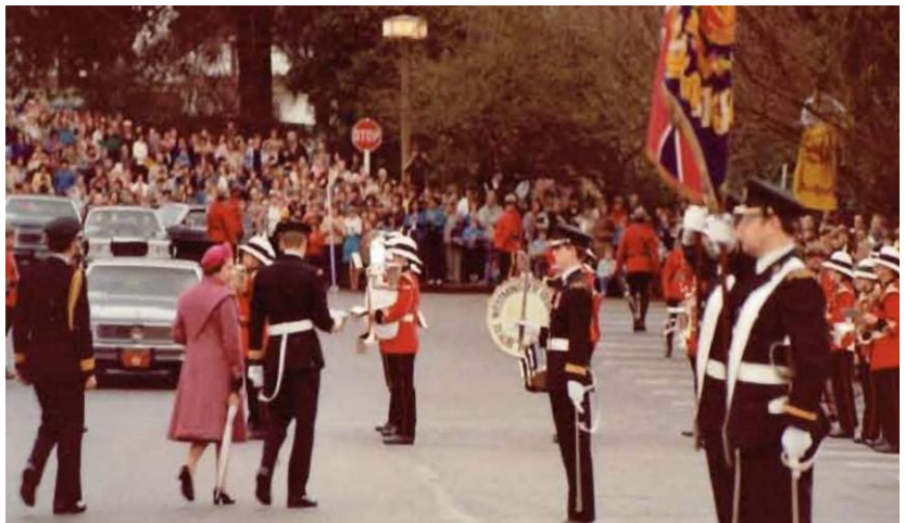
HM Queen Elizabeth starting to inspect The Royal Westminster Regiment